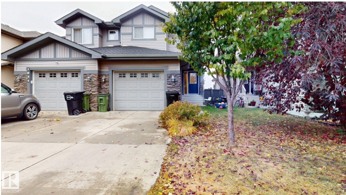
1030 177 Street SW Edmonton