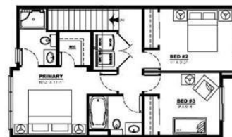
UPPER FLOOR PLAN = 653 SQ FT