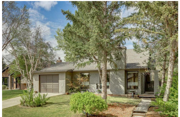
344 Oakwood Pl SW, Calgary, AB

**Open House Sat May 24 from 2-4pm** This spacious and thoughtfully designed home offers something for everyone—whether you're looking for natural light, private outdoor space, or room for the whole family to spread out. Step inside and you're immediately greeted by soaring vaulted ceilings, a cozy wood-burning fireplace, three South-facing windows that flood the space with natural light, and a direct view of the loft above. The adjacent dining area is generously sized, perfect for family meals or entertaining, and flows seamlessly into a functional kitchen. Off the kitchen, the mudroom provides access to the attached single garage and the backyard. It also includes hookups for a washer and dryer, making it as practical as it is spacious. Upstairs, you'll find a primary suite, two additional bedrooms, and a full bathroom. The open loft space ideal as a reading nook, library, or creative workspace. Down one level from the main floor is a welcoming rec room, a large fourth bedroom, and a full bathroom with a shower—ideal for guests, teenagers, or multigenerational living. Head down one more level and discover another versatile living space (perfect for a music room or home theater), a dedicated workshop with exterior exhaust capability, the utility area, and laundry. The beautifully treed backyard offers privacy, shade, and seasonal fruit from mature trees—a true oasis during summer months. Updates include a high-efficiency furnace (2017), electrical panel and Lux windows